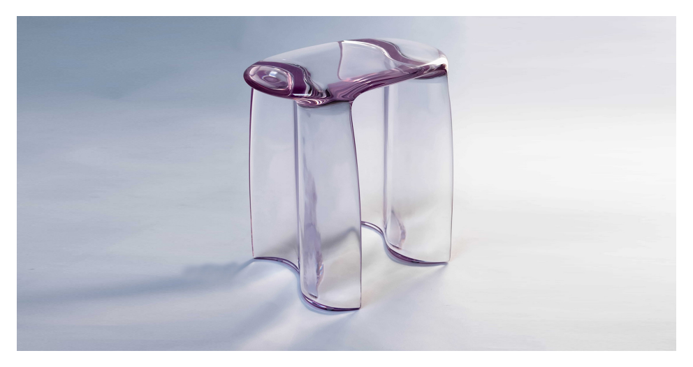
Lukas Cober New Wave stool in resin

By combining this fiberglass with <u>resin</u>, Lukas Cober shapes his furniture on the layers, superimposing and molding by hand many sheets of material. Applied layer by layer, this technique allows an artisanal approach of this originally industrial material and to obtain with precision the desired shapes. After having carefully connected and modeled the different elements of a part together, it is shaped for a long time to the hand to create smooth transitions and organic contours.