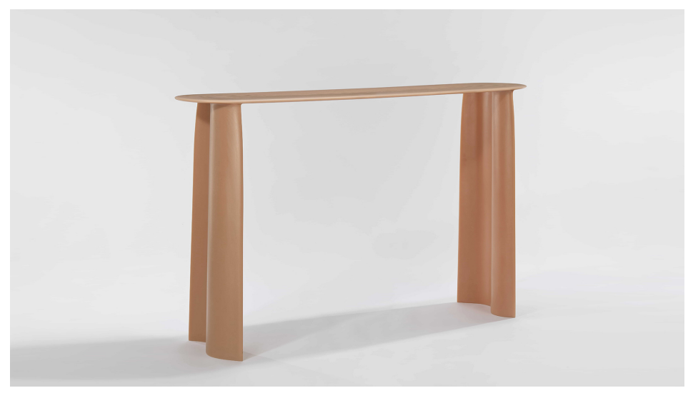
Lukas Cober New Wave Console in fiberglass and resine peau de pêche

By combining this fiberglass with <u>resin</u>, Lukas Cober shapes his furniture on the layers, superimposing and molding by hand many sheets of material. Applied layer by layer, this technique allows an artisanal approach of this originally industrial material and to obtain with precision the desired shapes. After having carefully connected and modeled the different elements of a part together, it is shaped for a long time to the hand to create smooth transitions and organic contours.